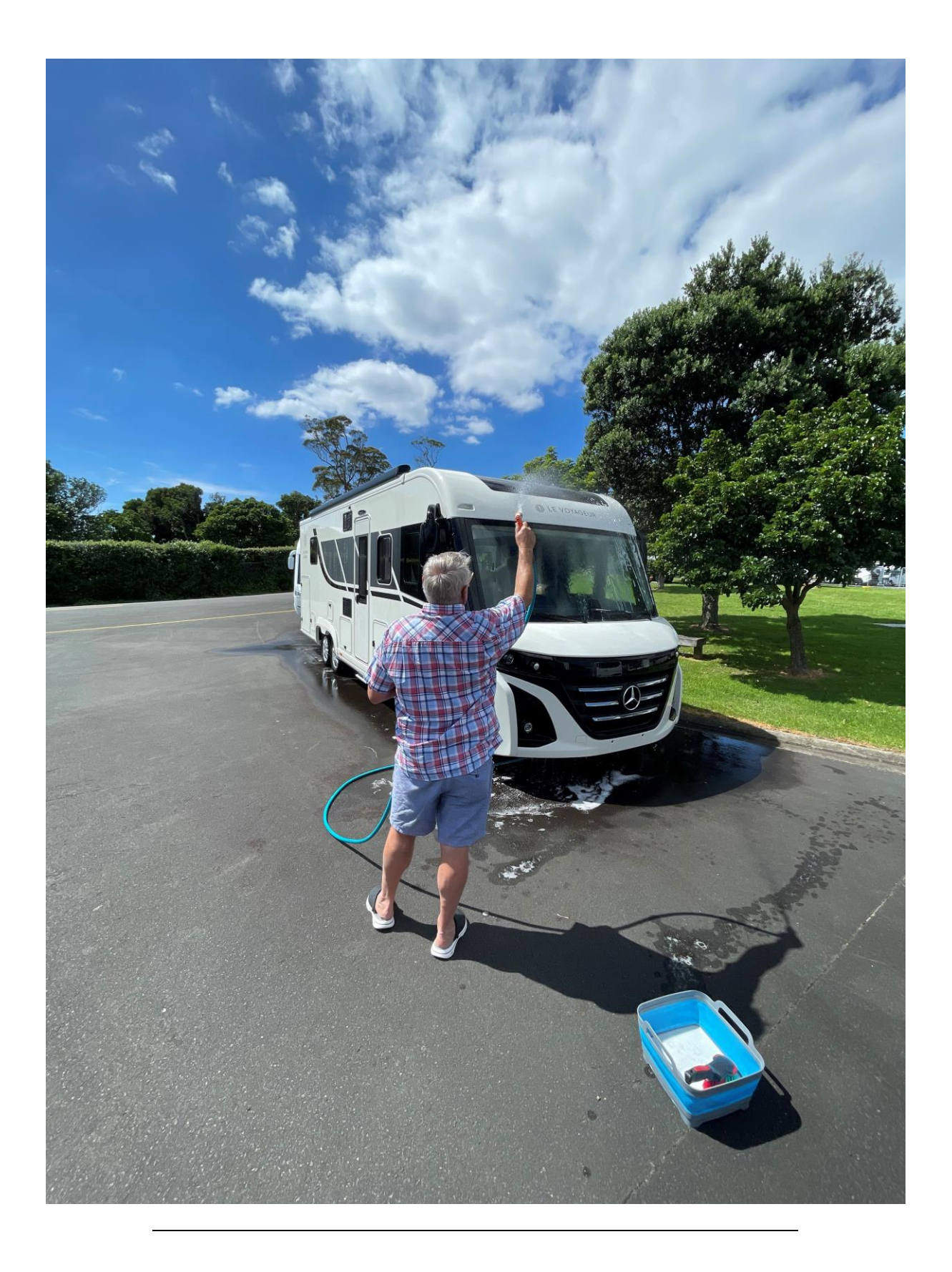
Great Weekend Destinations: Westcoast Region