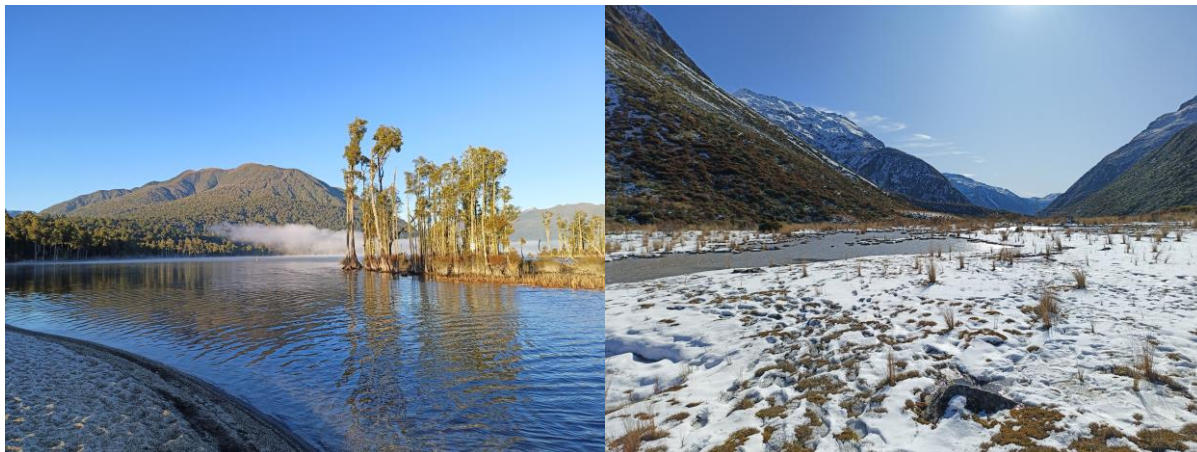
Above Left: Early winter morning at Lake Brunner.