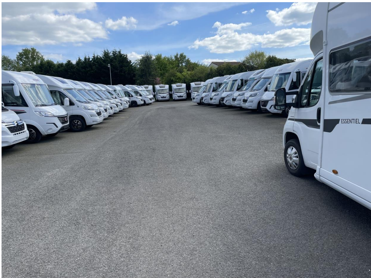
Above: Brand-new Pilote motorhomes waiting to be picked up and shipped.