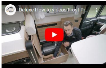
Frost Protection Valve Reset