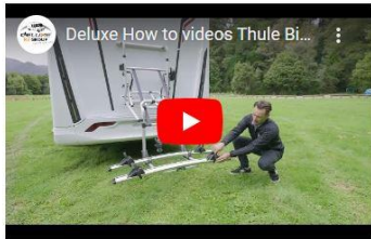
Thule Electric Bike Rack