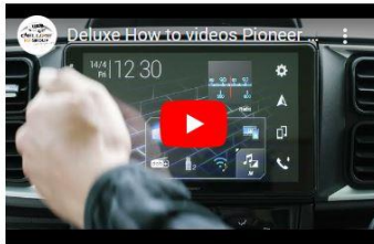
Pioneer Multimedia Head Unit