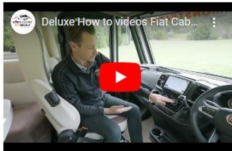
Fiat Cab Operation