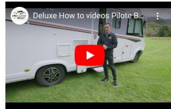
Pilote Battery Compartment