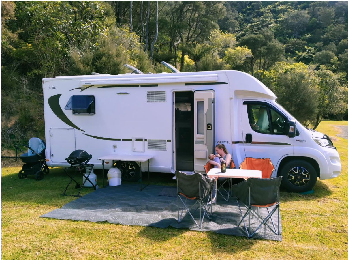
Above: Set up for the afternoon in Momorangi Bay